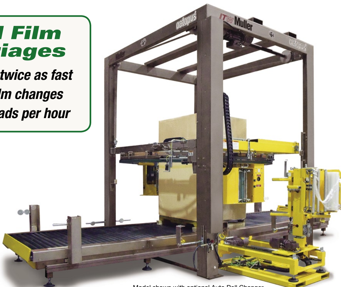
Model shown with optional Auto Roll Changer